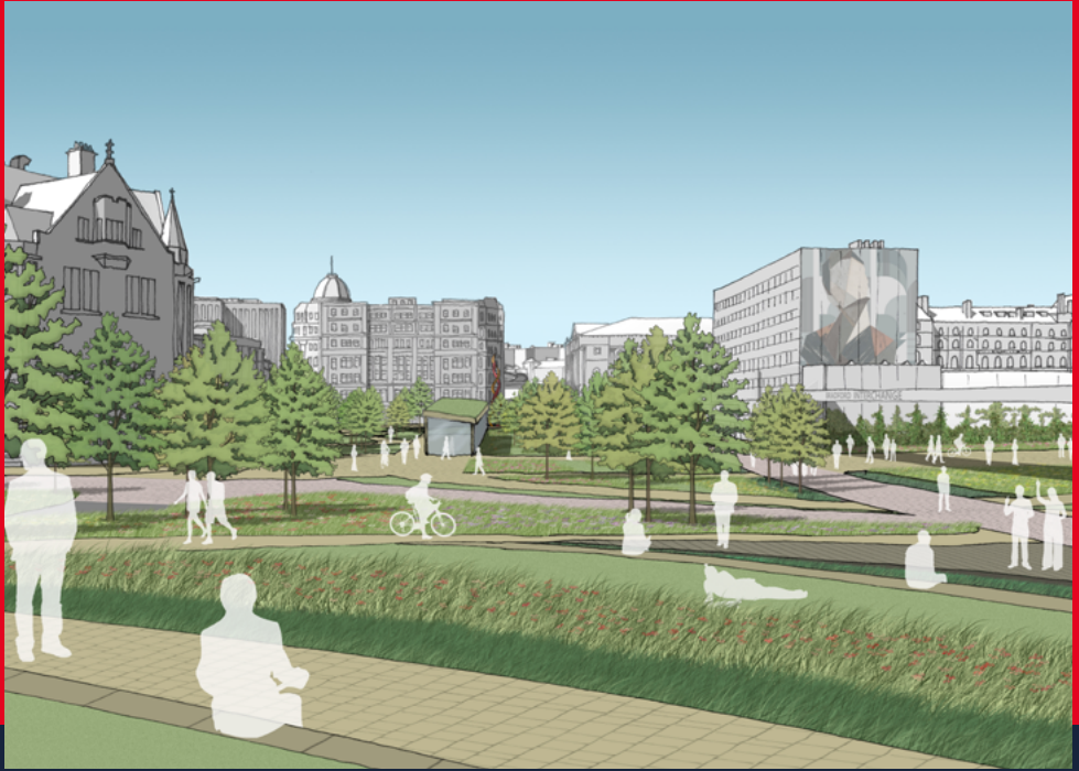
Artist Impression - Hall Ings Terraces

For a timetable in an alternative language, large print, Braille, audio CD or tape, please contact MetroLine on 0113 245 7676 .